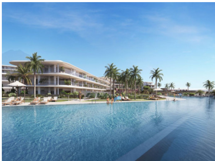
Large communal pool area