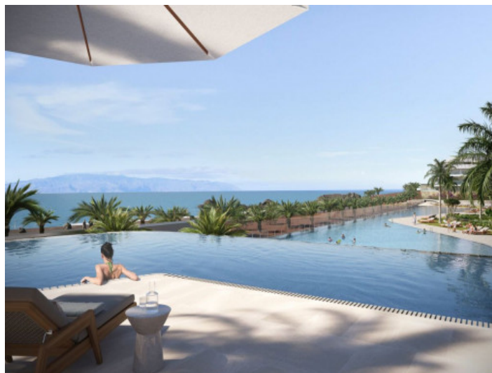
Stunning pool with views