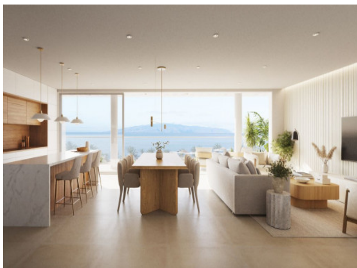
Views to the kitchen and dining area