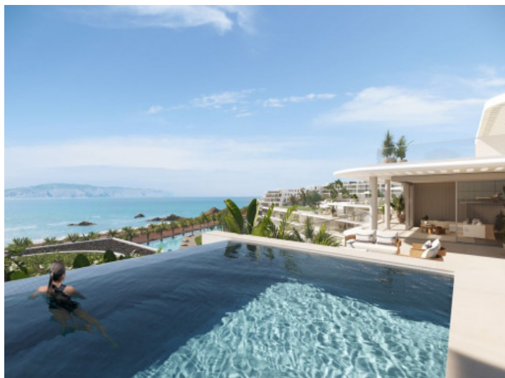
Roof terrace pool