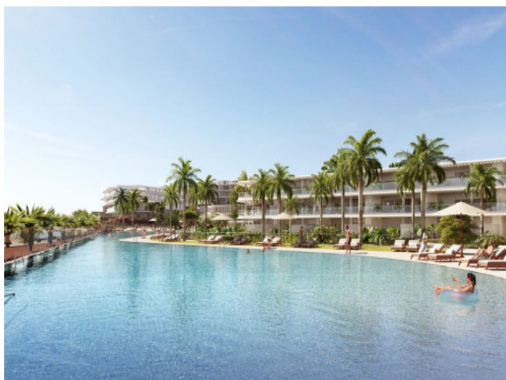
Sunny pool area