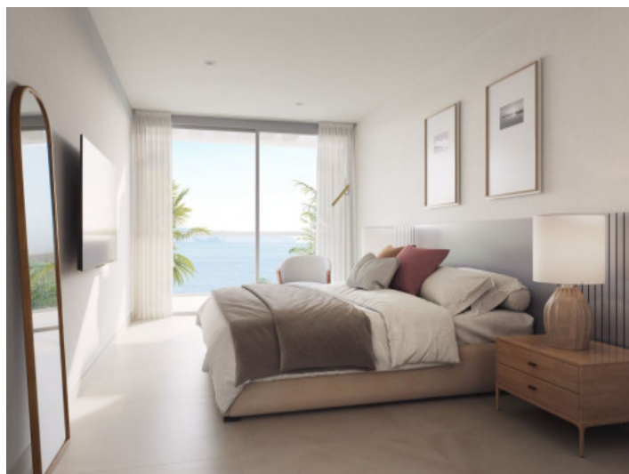
Bedroom with floor-to-ceiling windows

All information is correct to the best of our knowledge. Errors and prior sale excepted. This prospectus is purely for information purposes. Only the notarized deed of sale is legally binding.