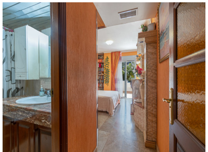
Bathroom en suite

All information is correct to the best of our knowledge. Errors and prior sale excepted. This prospectus is purely for information purposes. Only the notarized deed of sale is legally binding.