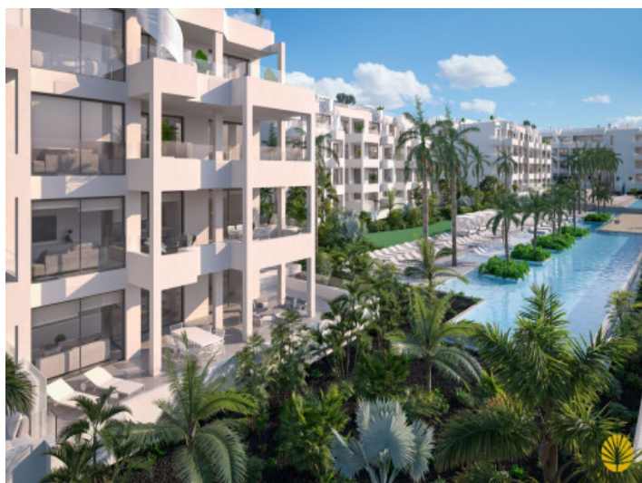
Newly - built