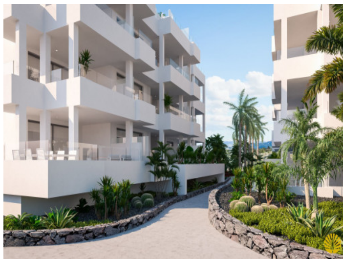
Entrance to the building

All information is correct to the best of our knowledge. Errors and prior sale excepted. This prospectus is purely for information purposes. Only the notarized deed of sale is legally binding.