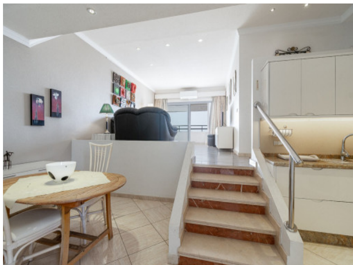
Dining and kitchen area