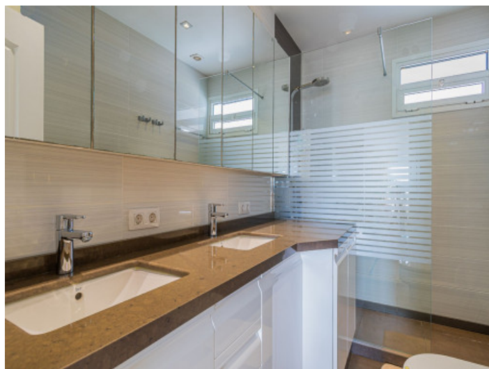
The flat offers 2 bathrooms

All information is correct to the best of our knowledge. Errors and prior sale excepted. This prospectus is purely for information purposes. Only the notarized deed of sale is legally binding.