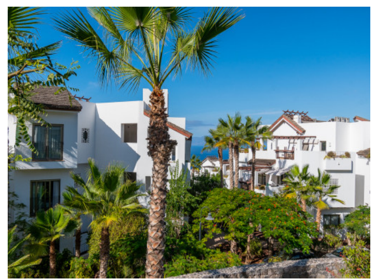
Partial sea views Elegant living area All information is correct to the best of our knowledge. Errors and prior sale excepted. This prospectus is purely for information purposes. Only the notarized deed of sale is legally binding.

PORTA TENERIFE • C./ CONQUISTADOR 8, 07001 PALMA TEL. +34 971 698 242 • INFO@PORTATENERIFE.COM