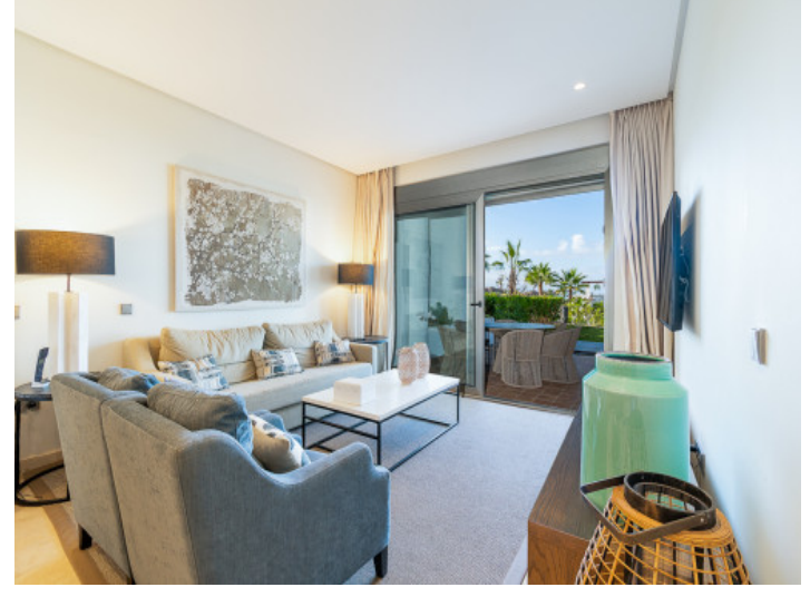
Living area with direct terrace access