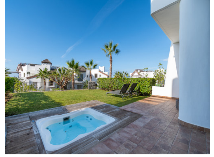
Terrace with jacuzzi