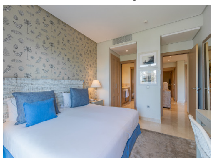
One of 2 bedrooms One of 2 bedrooms All information is correct to the best of our knowledge. Errors and prior sale excepted. This prospectus is purely for information purposes. Only the notarized deed of sale is legally binding.

PORTA TENERIFE • C./ CONQUISTADOR 8, 07001 PALMA TEL. +34 971 698 242 • INFO@PORTATENERIFE.COM