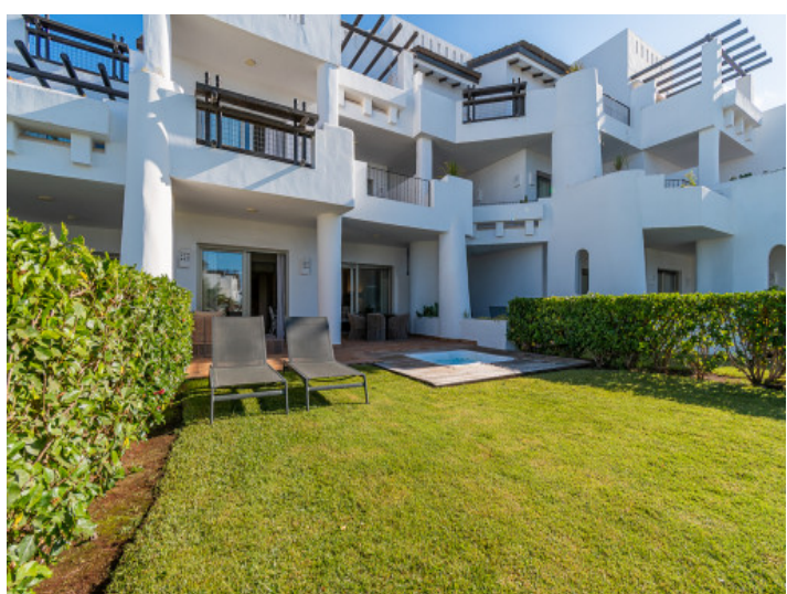
Well-maintained private garden All information is correct to the best of our knowledge. Errors and prior sale excepted. This prospectus is purely for information purposes. Only the notarized deed of sale is legally binding.

PORTA TENERIFE • C./ CONQUISTADOR 8, 07001 PALMA TEL. +34 971 698 242 • INFO@PORTATENERIFE.COM