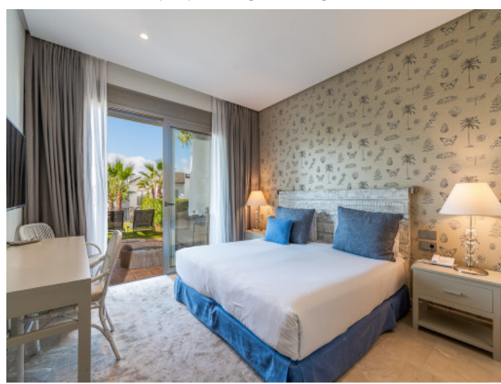
One of 2 bedrooms