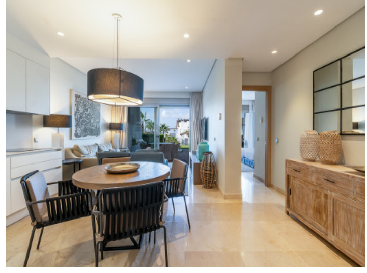
Open plan living and dining area