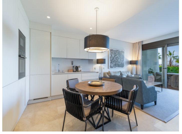
Modern kitchen and dining area