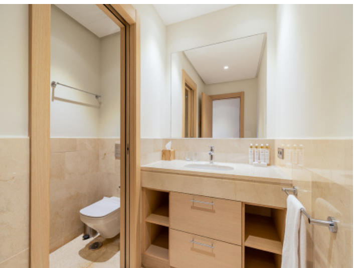
One of 2 bathrooms