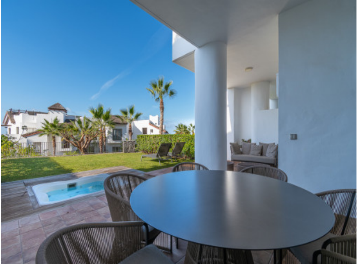
Outdoor dining area