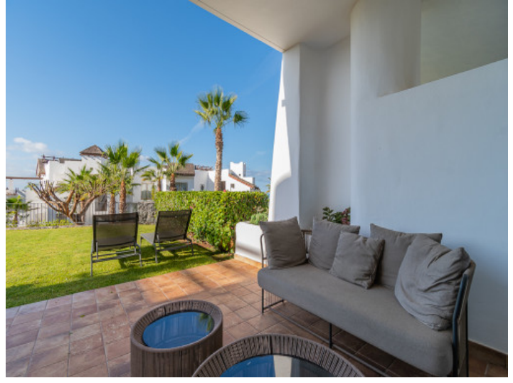
Covered terrace with cosy seating