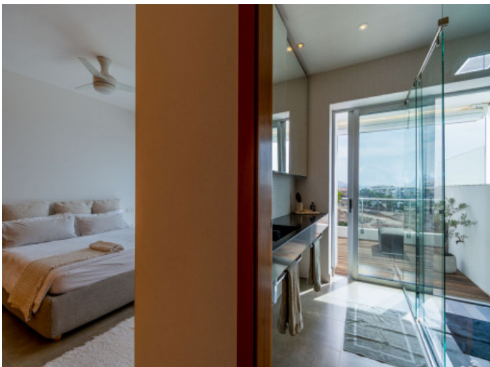
Bedroom and bathroom