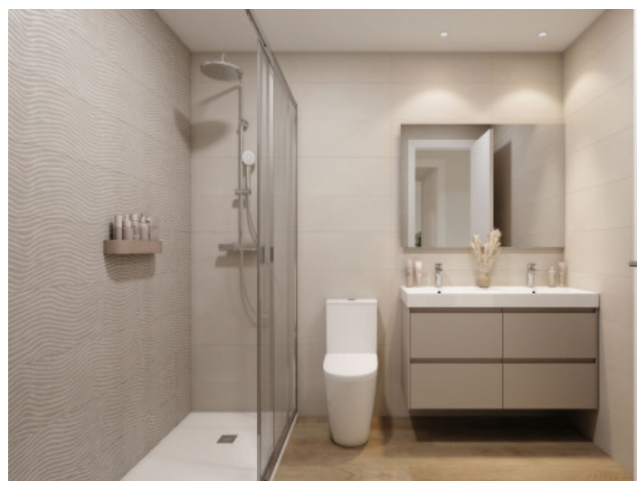
Bathroom with walk-in shower

All information is correct to the best of our knowledge. Errors and prior sale excepted. This prospectus is purely for information purposes. Only the notarized deed of sale is legally binding.