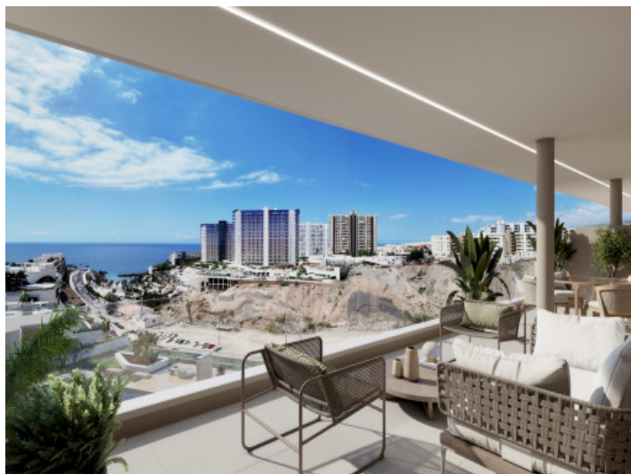
Amazing sea views