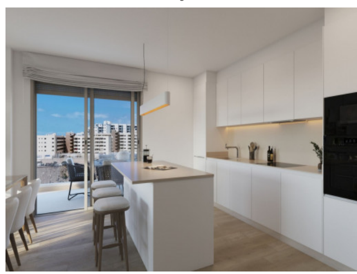
Modern kitchen Bright kitchen All information is correct to the best of our knowledge. Errors and prior sale excepted. This prospectus is purely for information purposes. Only the notarized deed of sale is legally binding.

PORTA TENERIFE • C./ CONQUISTADOR 8, 07001 PALMA TEL. +34 971 698 242 • INFO@PORTATENERIFE.COM