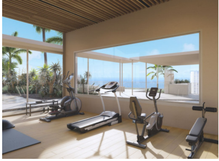
Second bathroom Gym All information is correct to the best of our knowledge. Errors and prior sale excepted. This prospectus is purely for information purposes. Only the notarized deed of sale is legally binding.

PORTA TENERIFE • C./ CONQUISTADOR 8, 07001 PALMA TEL. +34 971 698 242 • INFO@PORTATENERIFE.COM