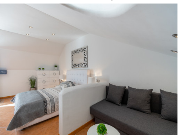
One of 2 bedrooms