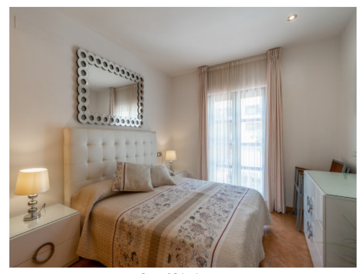
One of 2 bedrooms