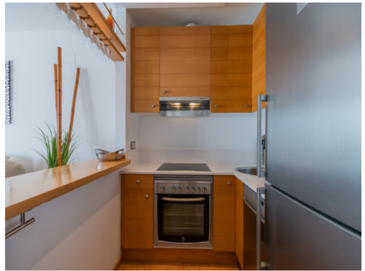
Timeless kitchen design