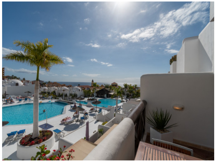
Fantastic pool area