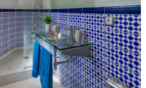
One of 2 bathrooms