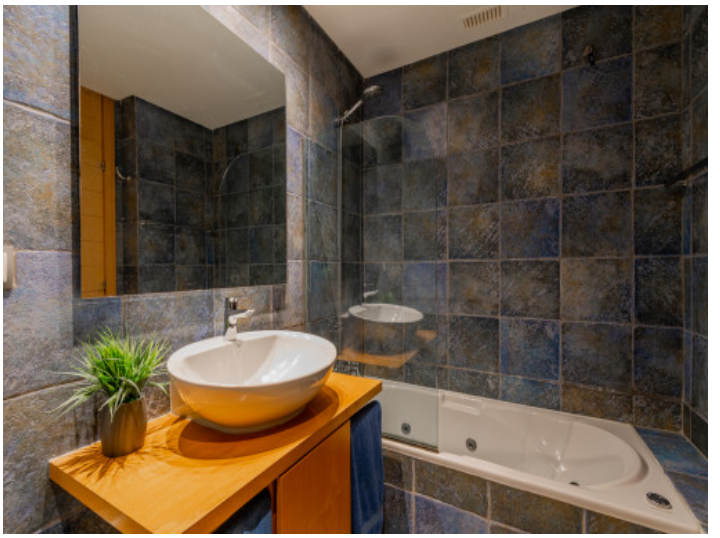
One of 2 bathrooms

All information is correct to the best of our knowledge. Errors and prior sale excepted. This prospectus is purely for information purposes. Only the notarized deed of sale is legally binding.