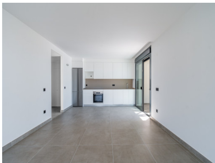
Kitchen and living area