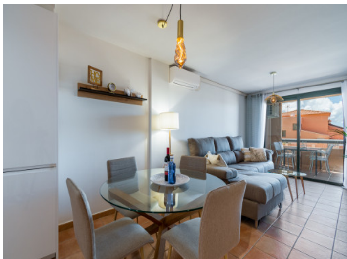
Living area and dining area