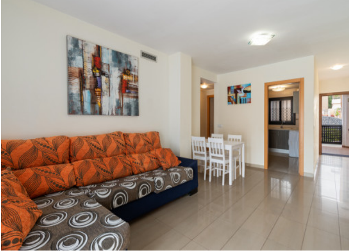
Living area Living area All information is correct to the best of our knowledge. Errors and prior sale excepted. This prospectus is purely for information purposes. Only the notarized deed of sale is legally binding.

PORTA TENERIFE • C./ CONQUISTADOR 8, 07001 PALMA TEL. +34 971 698 242 • INFO@PORTATENERIFE.COM