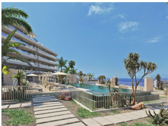
Pool and garden