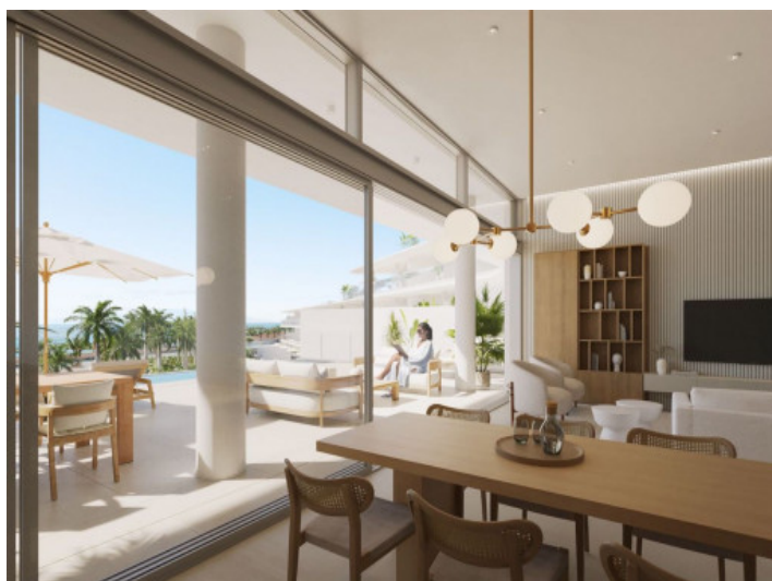
Bright living and dining area