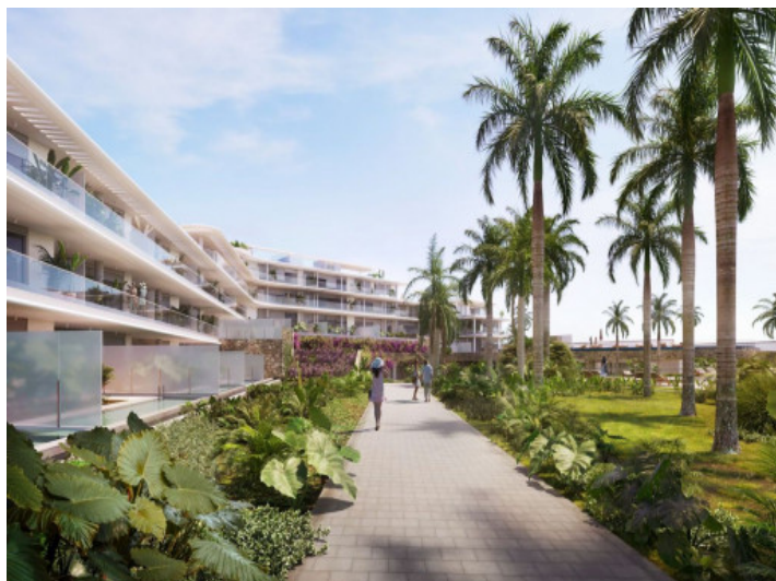
Beautiful community garden

All information is correct to the best of our knowledge. Errors and prior sale excepted. This prospectus is purely for information purposes. Only the notarized deed of sale is legally binding.