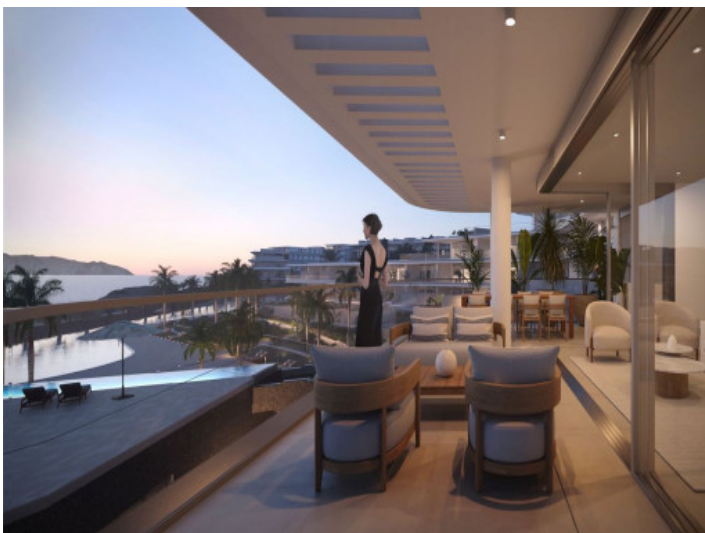
Covered terrace with stunning views