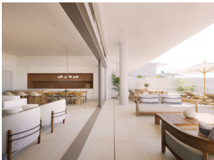
Living area with access to the terrace