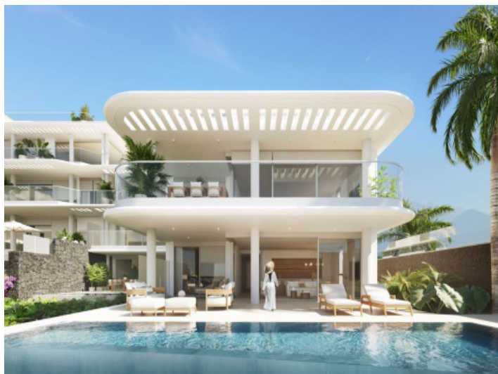
Luxurious flat with terrace, garage parking and sea views in Guía de Isora