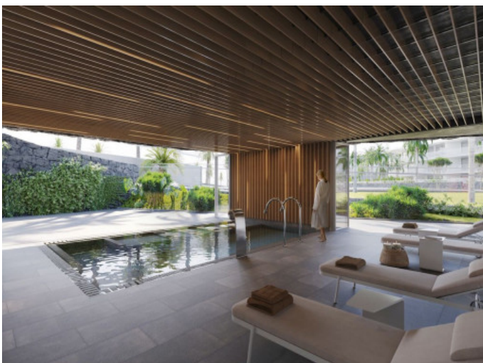
Community indoor pool