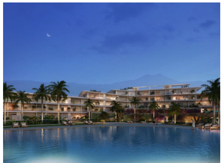
Luxurious residential complex

All information is correct to the best of our knowledge. Errors and prior sale excepted. This prospectus is purely for information purposes. Only the notarized deed of sale is legally binding.