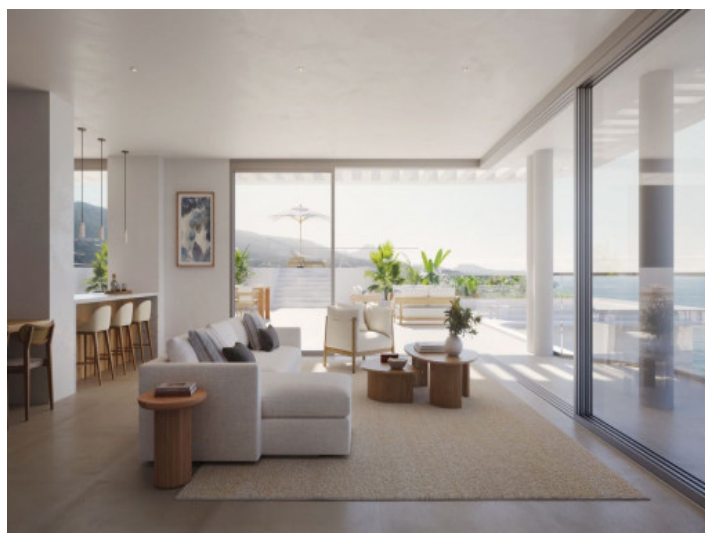
Large living area