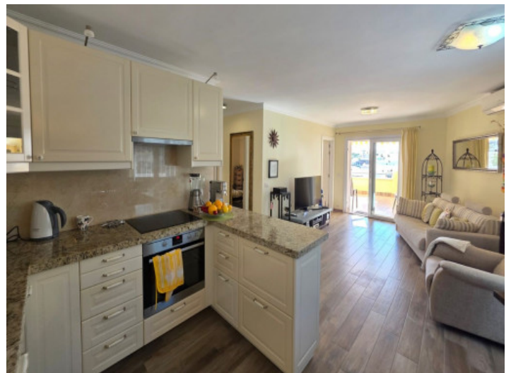
Kitchen and living area

All information is correct to the best of our knowledge. Errors and prior sale excepted. This prospectus is purely for information purposes. Only the notarized deed of sale is legally binding.