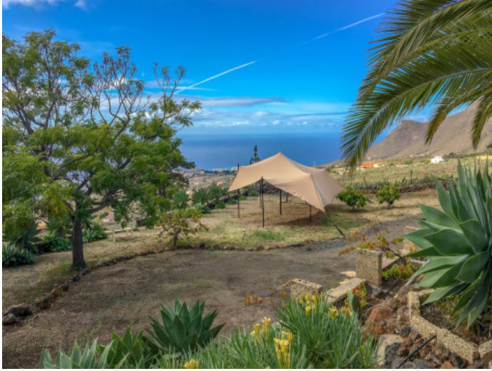
Breathtaking sea views