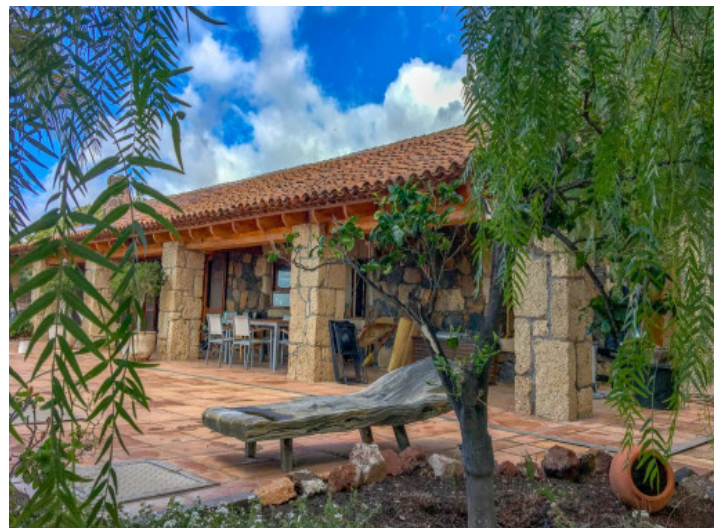
Alternative view of the covered terrace

All information is correct to the best of our knowledge. Errors and prior sale excepted. This prospectus is purely for information purposes. Only the notarized deed of sale is legally binding.