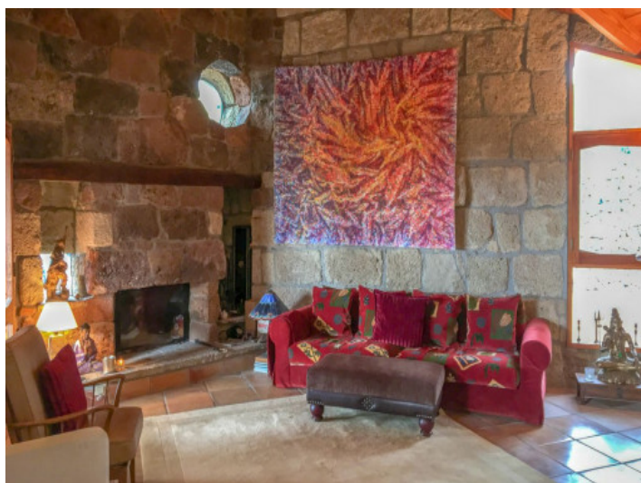
Cosy living area with fireplace