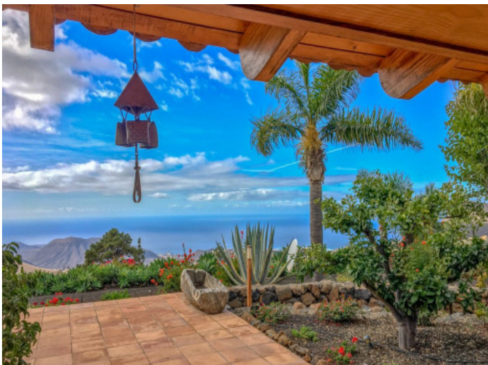
Impressive sea views from the terrace