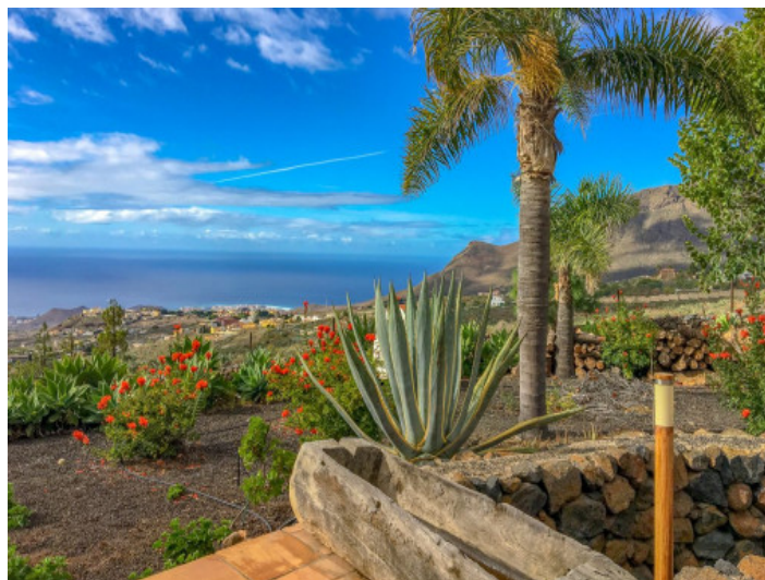
Alternative view of the garden

All information is correct to the best of our knowledge. Errors and prior sale excepted. This prospectus is purely for information purposes. Only the notarized deed of sale is legally binding.