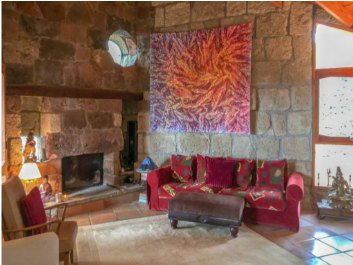
Cosy living area with fireplace