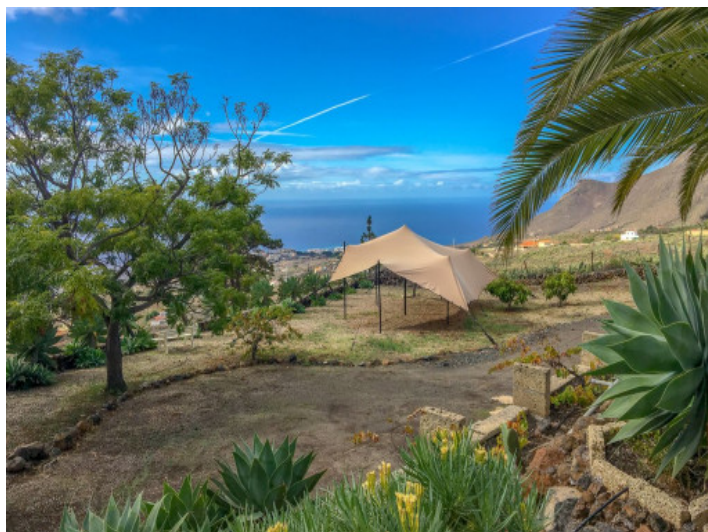
Breathtaking sea views