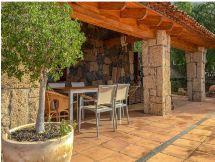
Spacious terrace with outdoor dining area