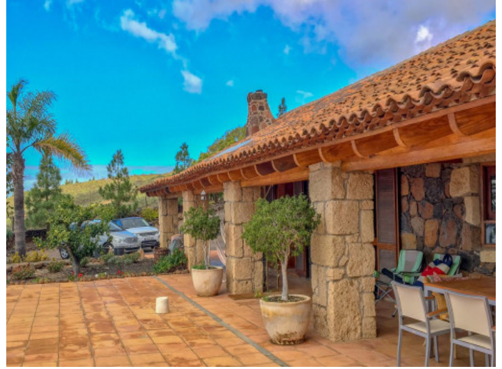
Partly covered terrace