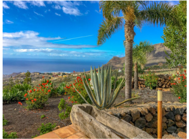
Alternative view of the garden

All information is correct to the best of our knowledge. Errors and prior sale excepted. This prospectus is purely for information purposes. Only the notarized deed of sale is legally binding.