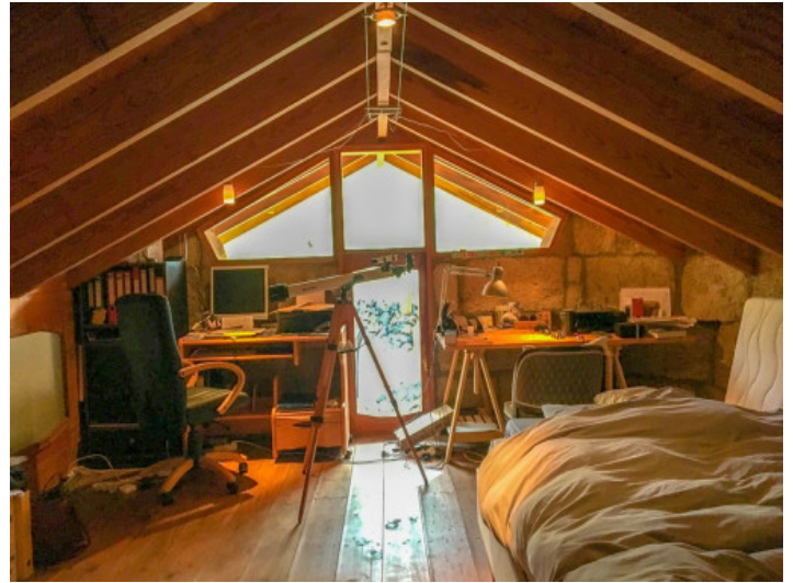
Study in the attic