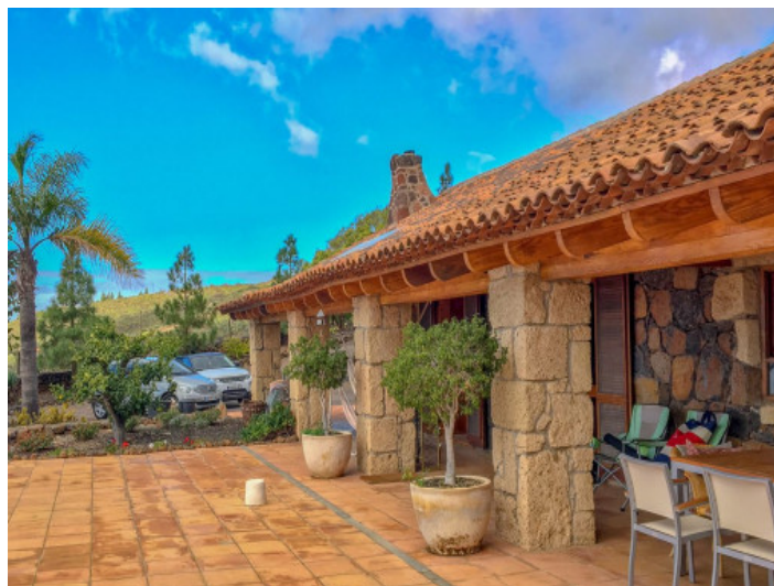
Partly covered terrace