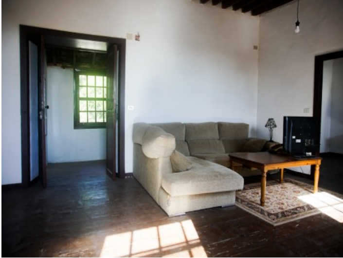
View of the living area