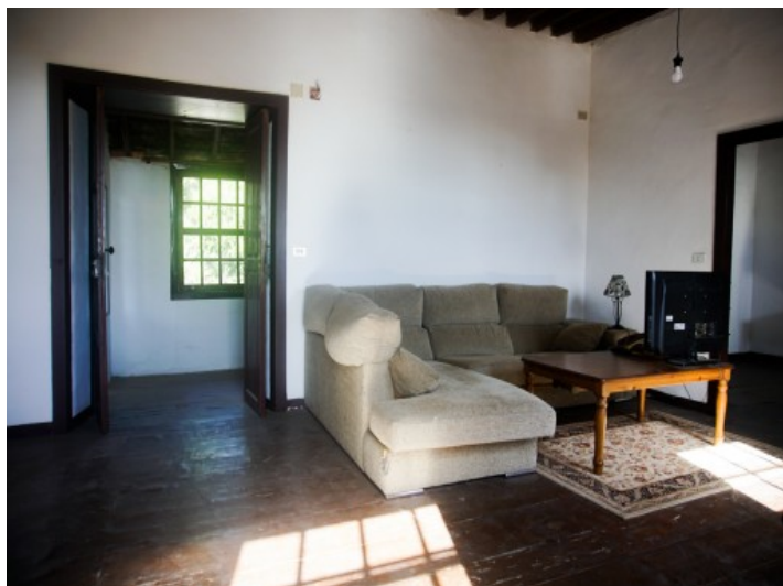
View of the living area