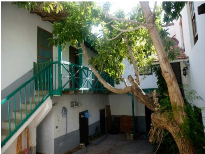
Large patio of the house