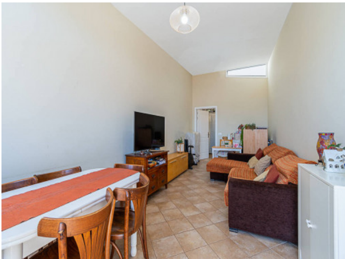
Additional living room with dining area