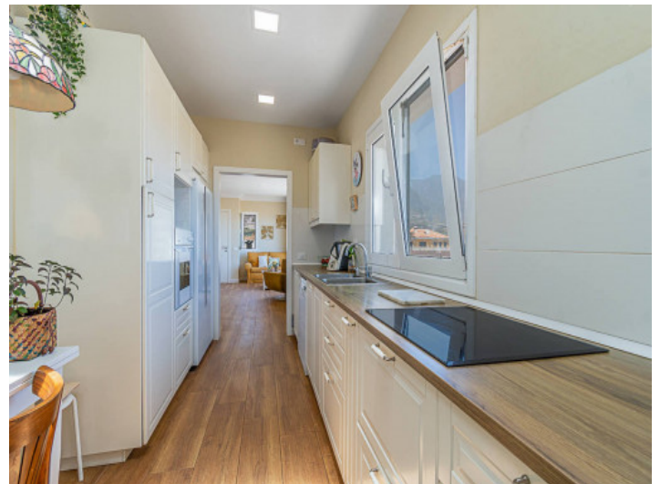
Modern, fully equipped kitchen