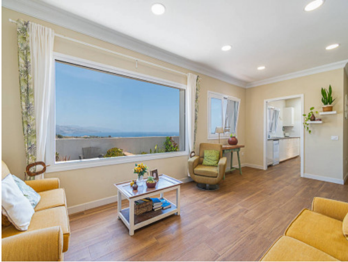
Living area with sea views