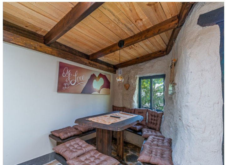
Relax and chill

All information is correct to the best of our knowledge. Errors and prior sale excepted. This prospectus is purely for information purposes. Only the notarized deed of sale is legally binding.