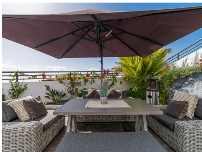
Comfortable chill out