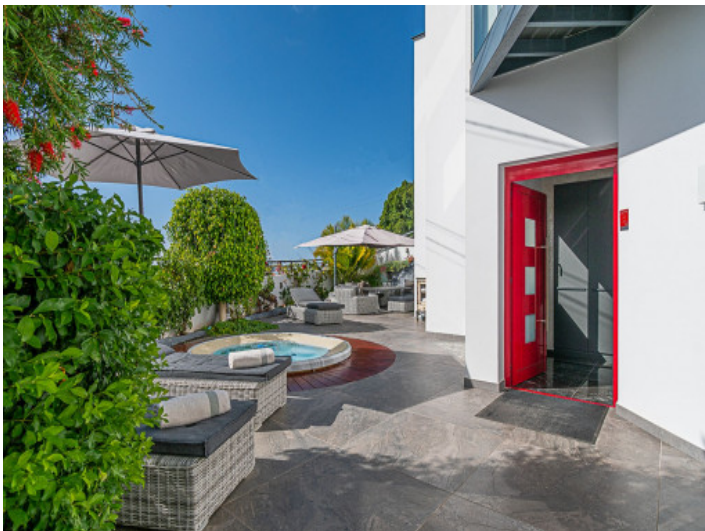
Entrance of this charming villa