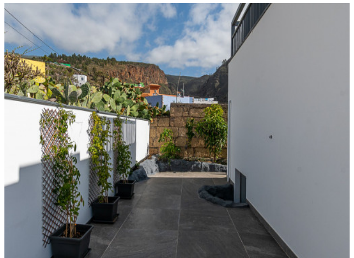
Easy maintain patio area

All information is correct to the best of our knowledge. Errors and prior sale excepted. This prospectus is purely for information purposes. Only the notarized deed of sale is legally binding.