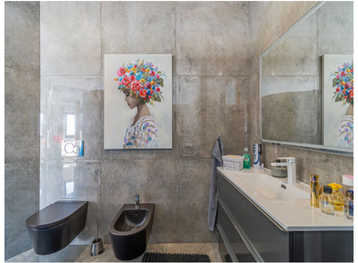
Fully equipped 2nd bathroom