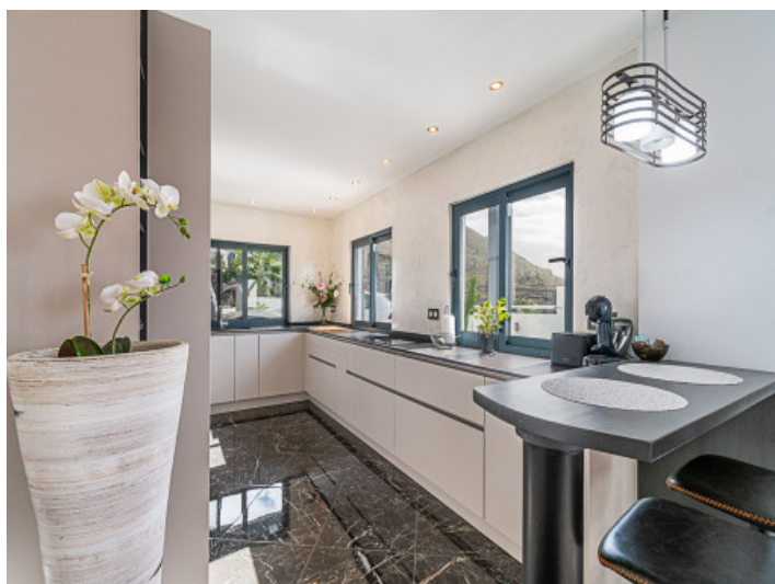
Quality kitchen furnitures vom "Leicht"