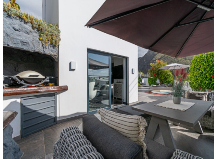
Outdoor area in front of the living room