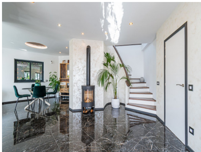
Bright and modern furnished