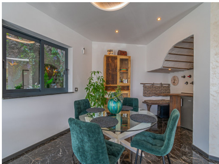
Beautiful dining area