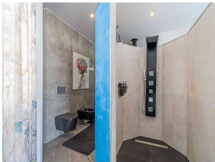
Shower area of the en suite bathroom

All information is correct to the best of our knowledge. Errors and prior sale excepted. This prospectus is purely for information purposes. Only the notarized deed of sale is legally binding.