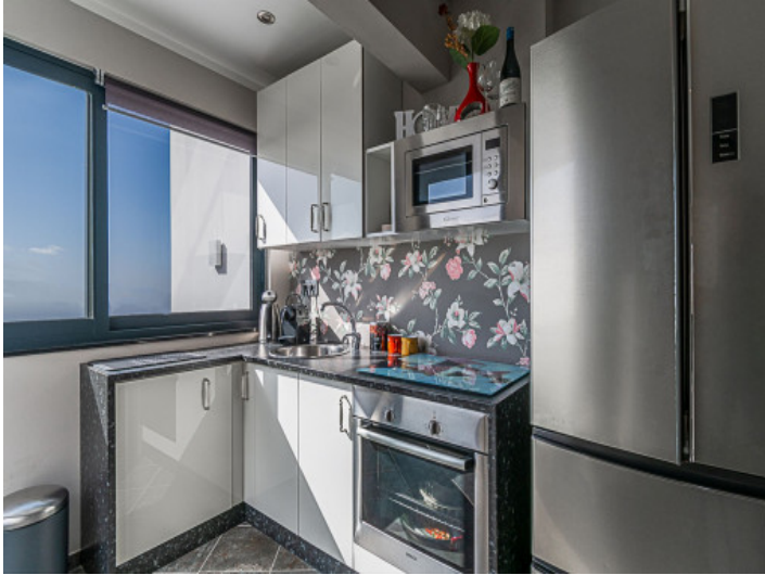
Kitchen for the guest area