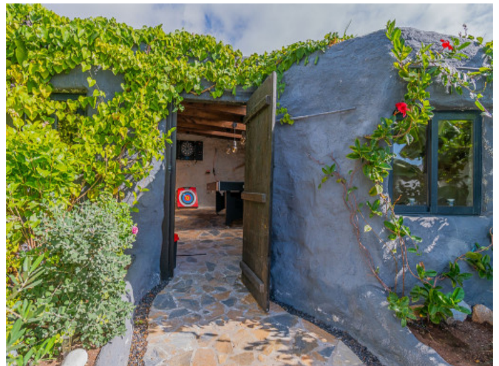
Garden area and acces to the chill out area