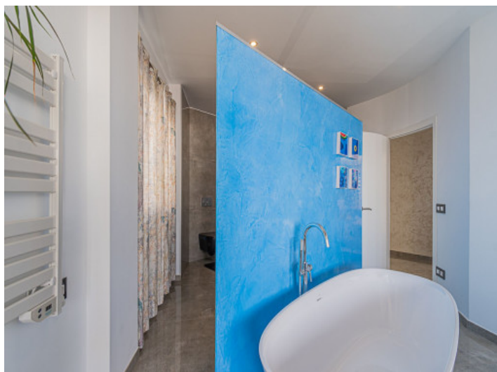
Bath en suite master bedroom