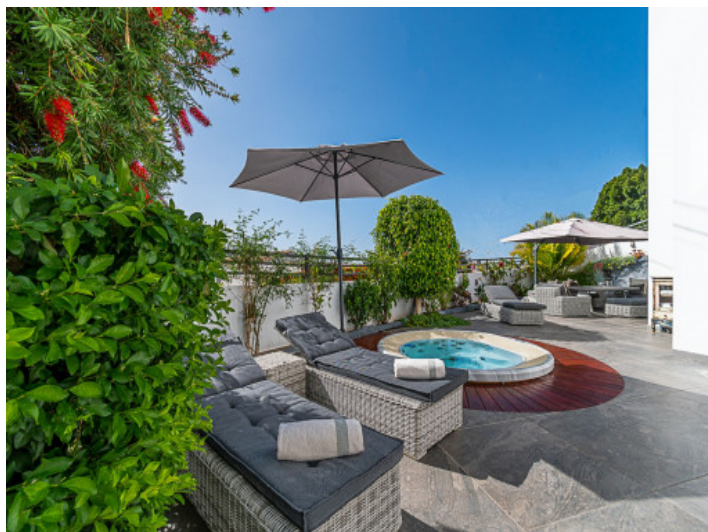
Beautiful sundeck with a refreshing whirlpool