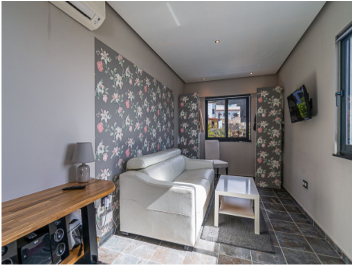
The 2nd bedroom with walking closet