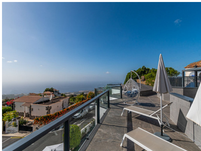
Amazing views and sunsets