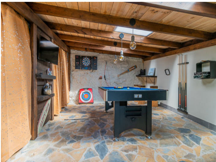
Billard and gaming area