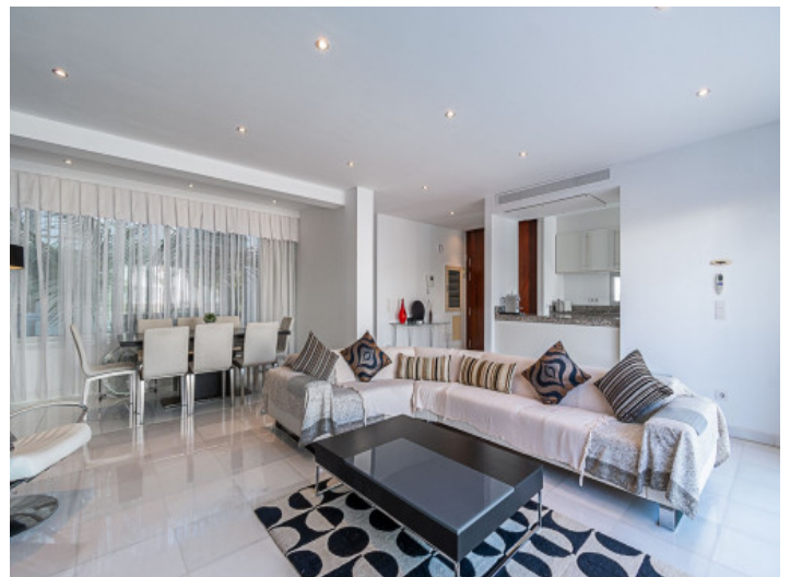
Bright living and dining area

All information is correct to the best of our knowledge. Errors and prior sale excepted. This prospectus is purely for information purposes. Only the notarized deed of sale is legally binding.