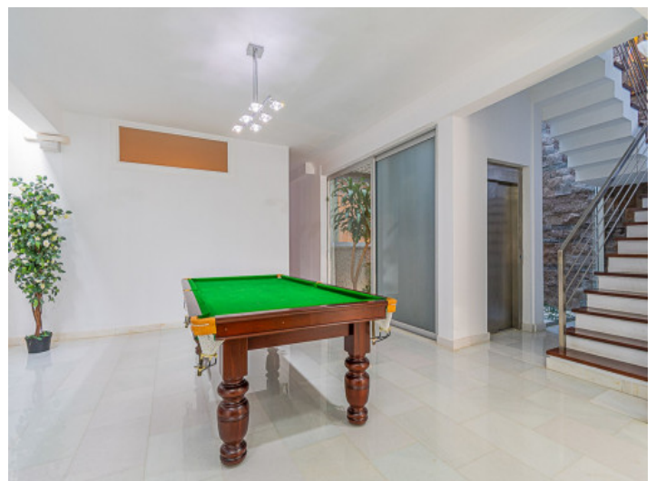
Game room in the basement easy reachable by elevator or staircase

All information is correct to the best of our knowledge. Errors and prior sale excepted. This prospectus is purely for information purposes. Only the notarized deed of sale is legally binding.