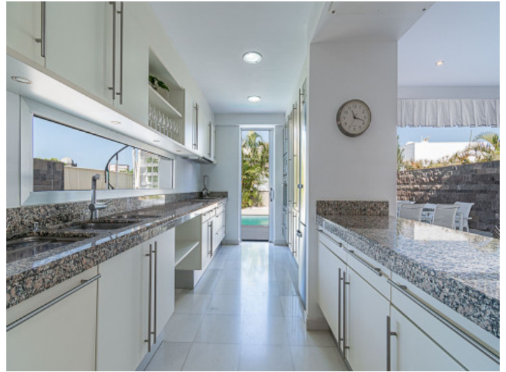
Large and modern kitchen