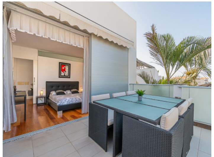
Master bedroom with direct access to the rooftop chillout area