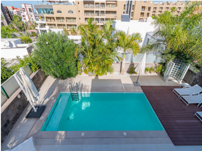
View from the rooftop over the pool and neighborhood