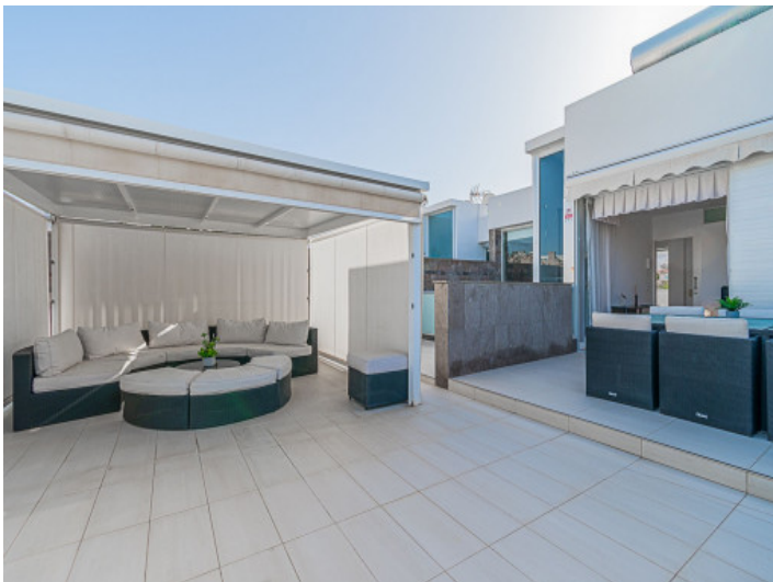
Rooftop with chillout lounge