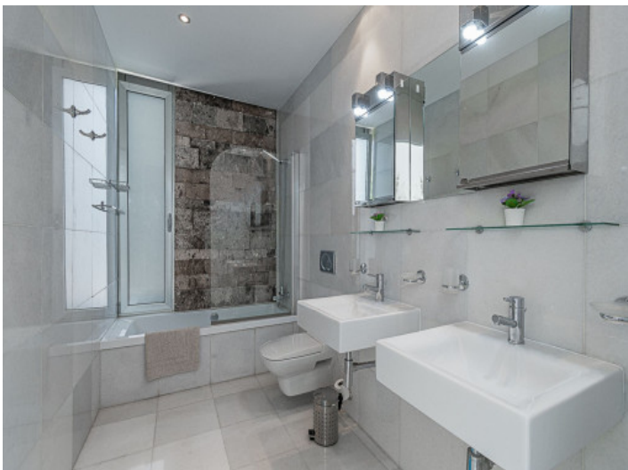
Bath en suite with shower