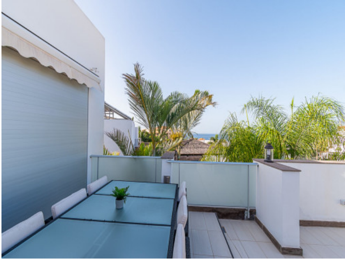
Large rooftop with sea views