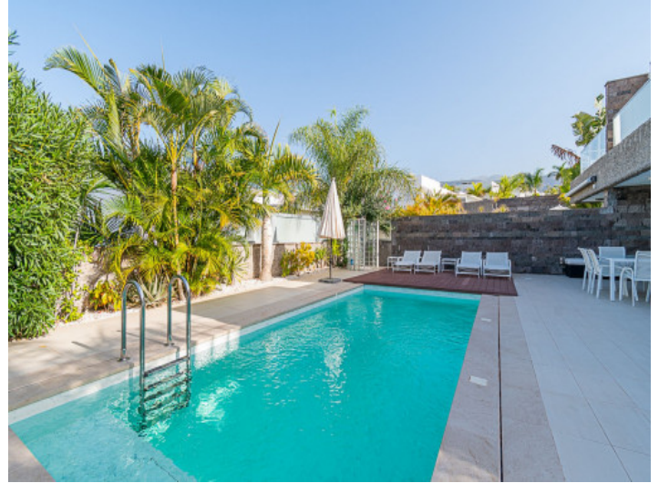
Tropical pool area