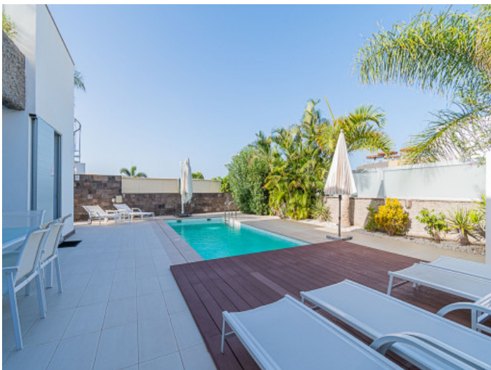
Join the perfect pool area