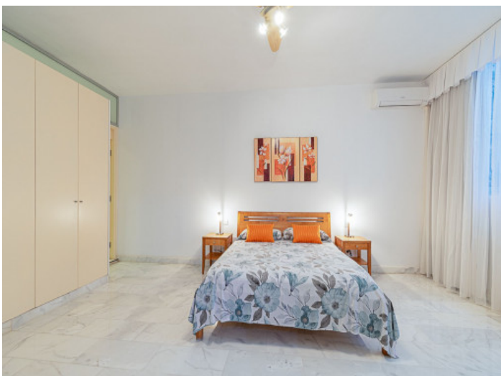
Bright bedrooms with built-in wardrobes