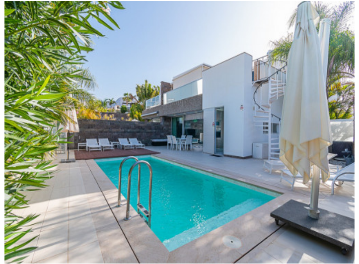
Alternative view from the property