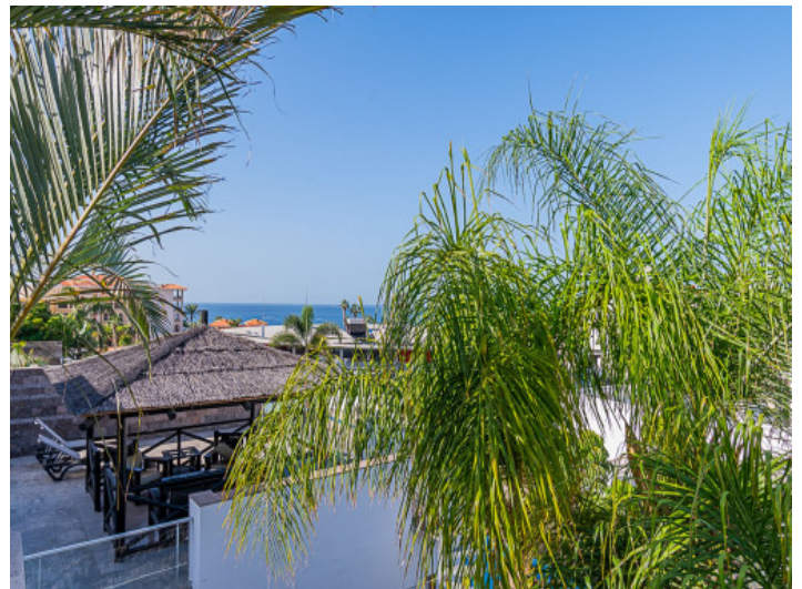
Sea views from the rooftop