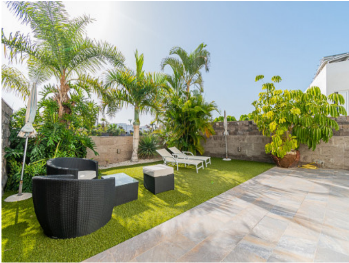
Beautiful green courtyard