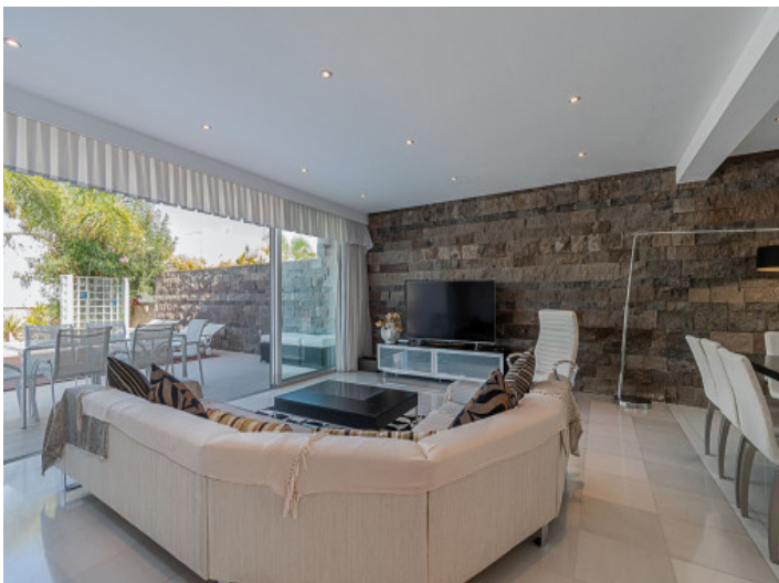
Living and dining area facing to the pool