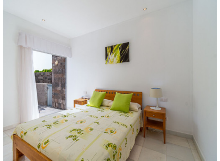
Bedroom with nice views