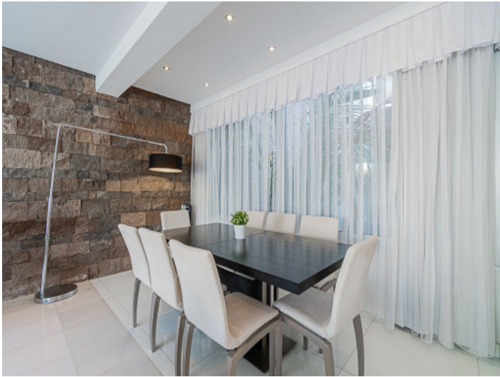
Dining area with natural stone wall