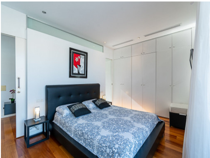
Bedroom with bath en suite