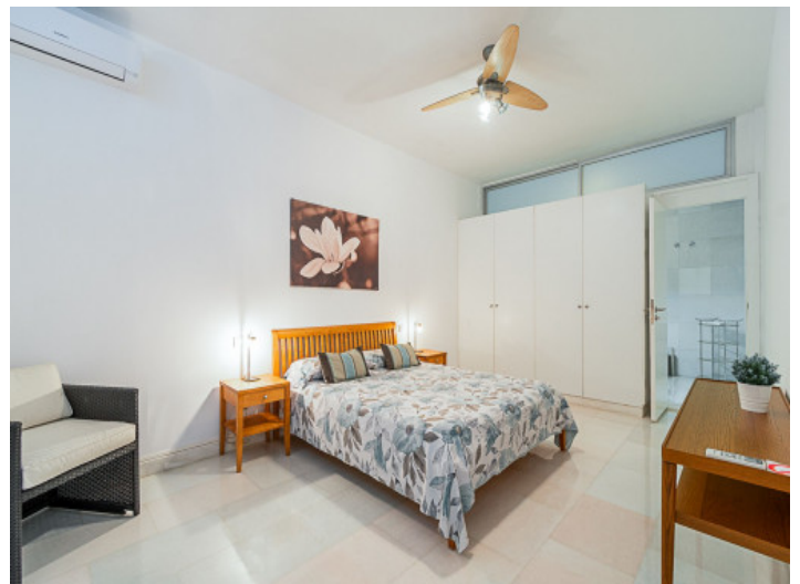
Another large bedroom with bath en suite

All information is correct to the best of our knowledge. Errors and prior sale excepted. This prospectus is purely for information purposes. Only the notarized deed of sale is legally binding.