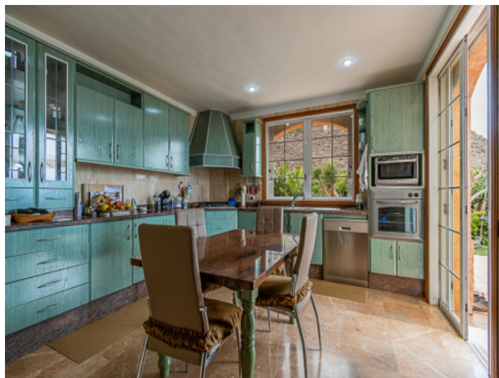
Kitchen and dining area