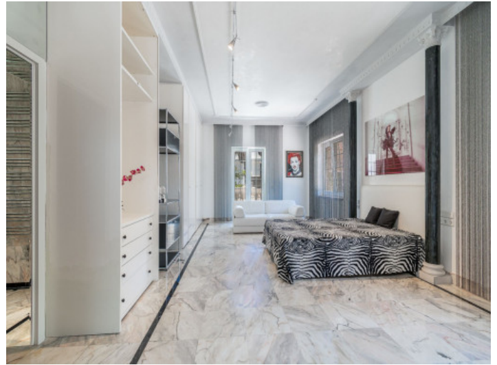
Five elegant bedrooms