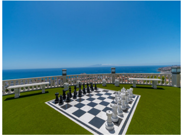
Amazing sea views