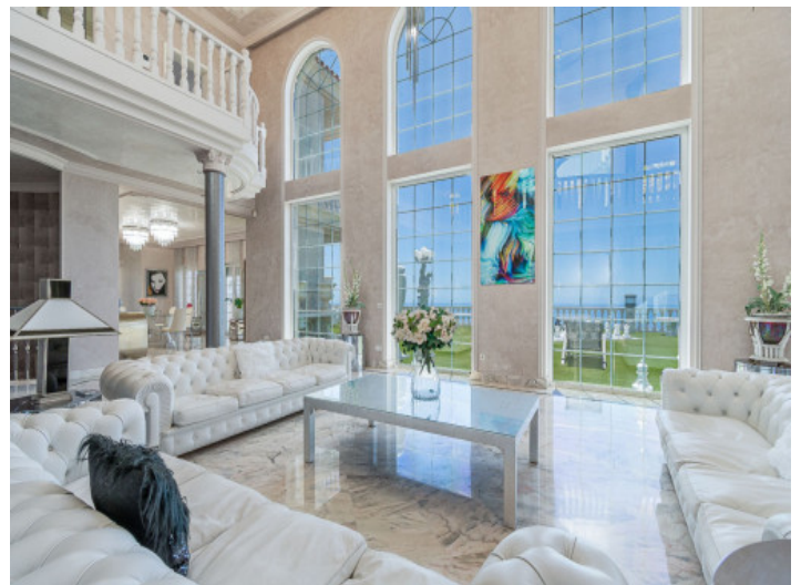
Living area with sea and garden views

All information is correct to the best of our knowledge. Errors and prior sale excepted. This prospectus is purely for information purposes. Only the notarized deed of sale is legally binding.