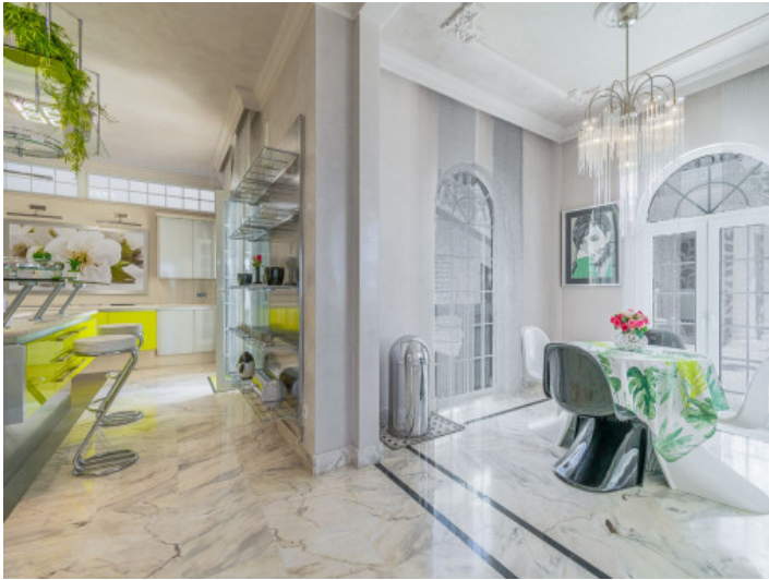
Breakfast area in the kitchen