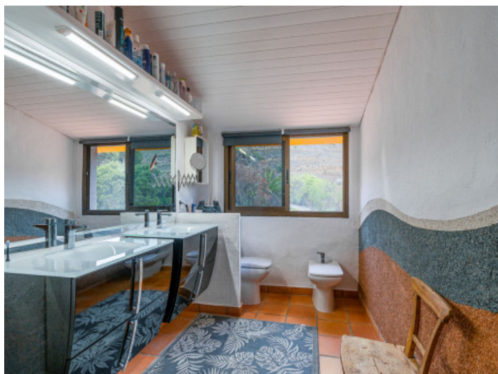
The villa offers 5 bathrooms