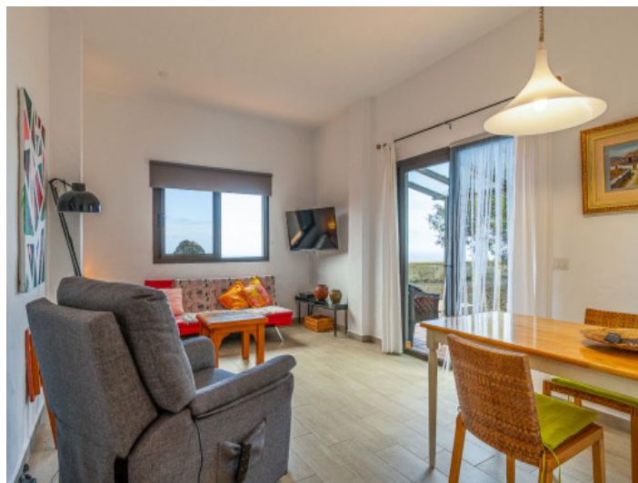
Living area guest apartment