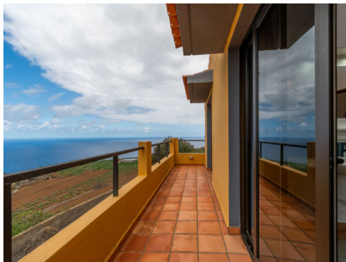
Balcony with sea views