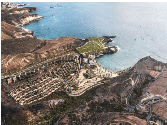
Views to the plot