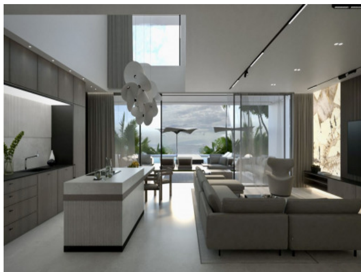
Large window fronts provide plenty of light

All information is correct to the best of our knowledge. Errors and prior sale excepted. This prospectus is purely for information purposes. Only the notarized deed of sale is legally binding.