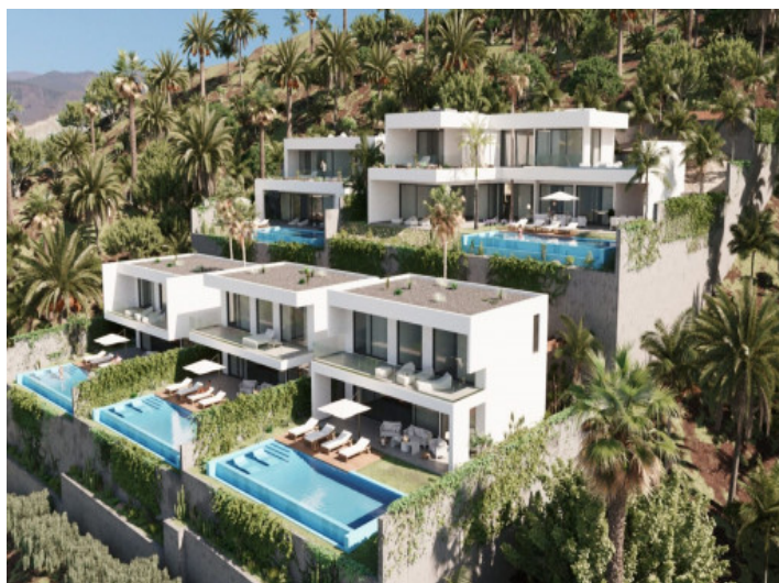
Exclusive living at Costa Adeje

All information is correct to the best of our knowledge. Errors and prior sale excepted. This prospectus is purely for information purposes. Only the notarized deed of sale is legally binding.