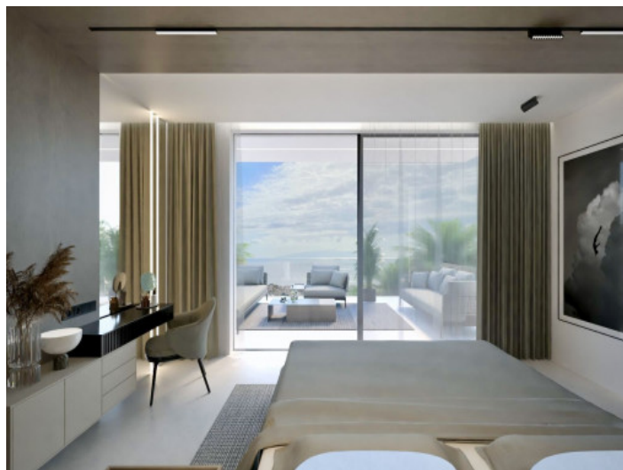
Bedroom on the first floor