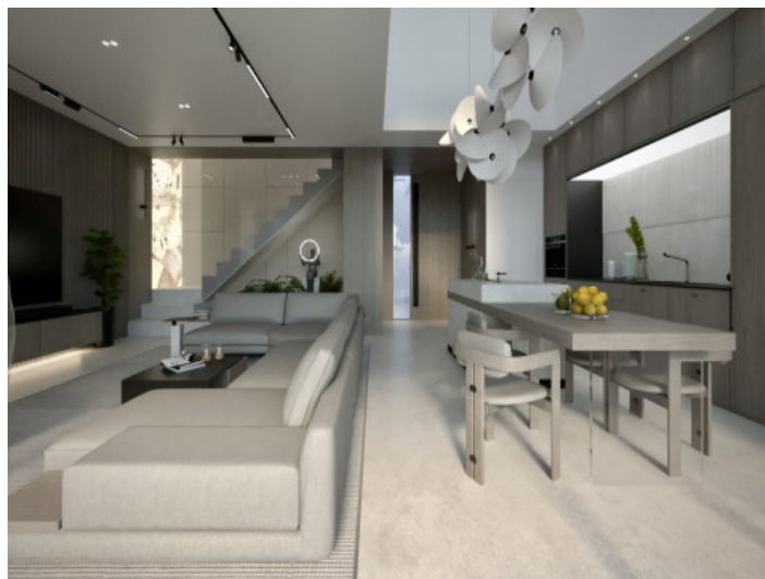
Open room layout