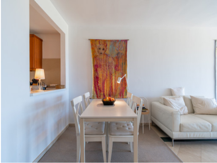
Dining and living area