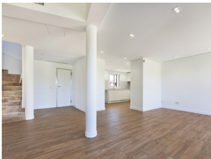
Spacious living/dining area