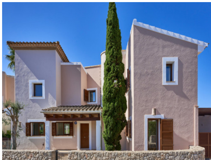
Exclusive living directly on the Santa Ponsa golf course – where