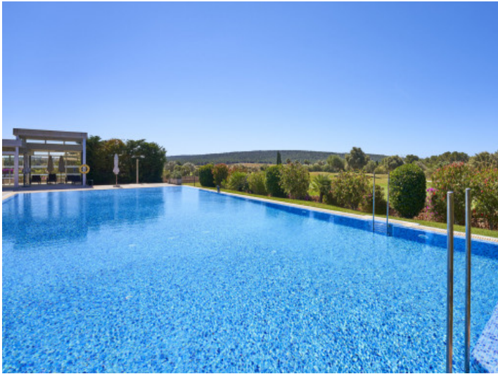
Large communal pool overlooking the golf course