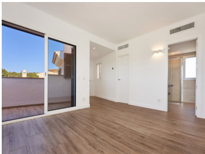
One of the three bedrooms