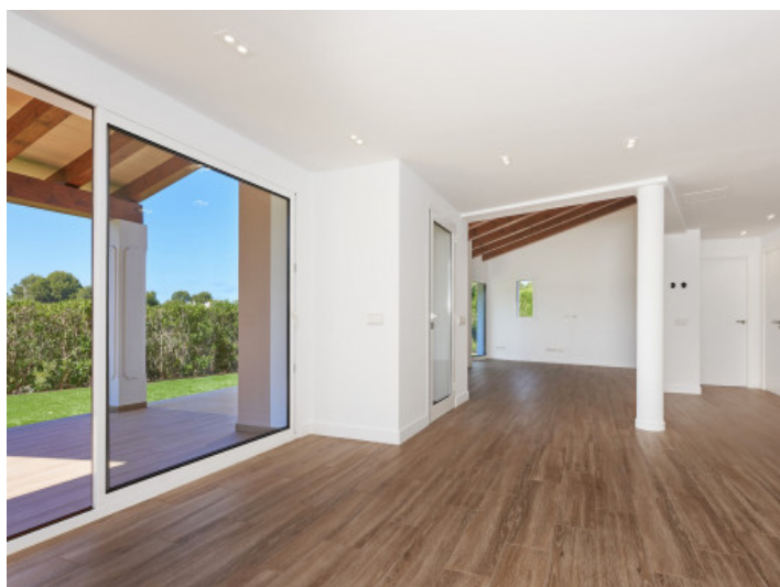
Bright living/dining area with access to the garden