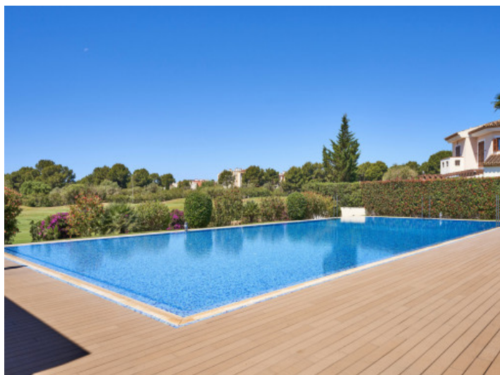
Communal pool for relaxing