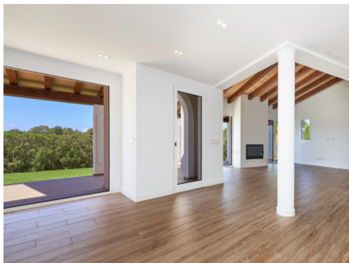
Living area with beautiful wooden beams and access to the garden

All information is correct to the best of our knowledge. Errors and prior sale excepted. This prospectus is purely for information purposes. Only the notarized deed of sale is legally binding.