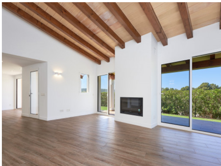
Light-flooded living area with access to the garden