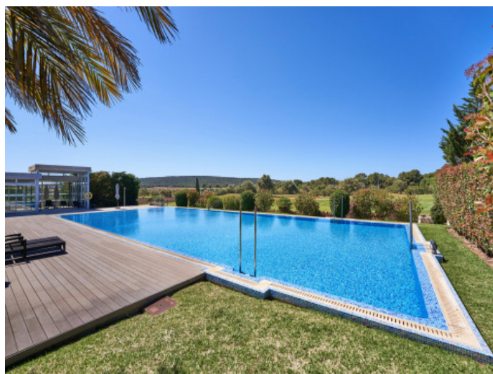
Generous communal area