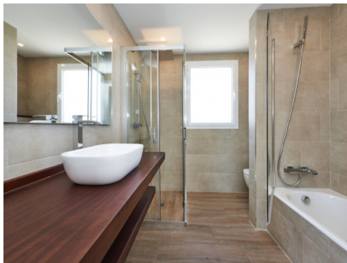
Spacious en-suite bathroom