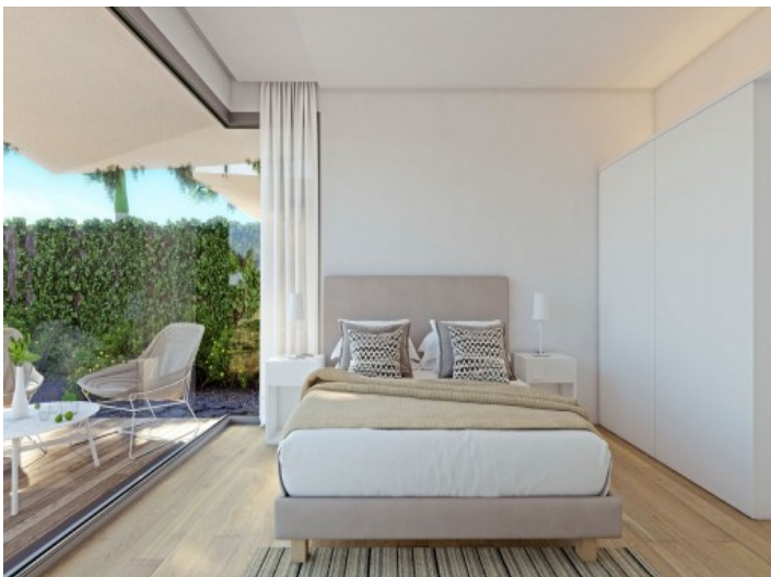
Master bedroom with panoramic windows

All information is correct to the best of our knowledge. Errors and prior sale excepted. This prospectus is purely for information purposes. Only the notarized deed of sale is legally binding.