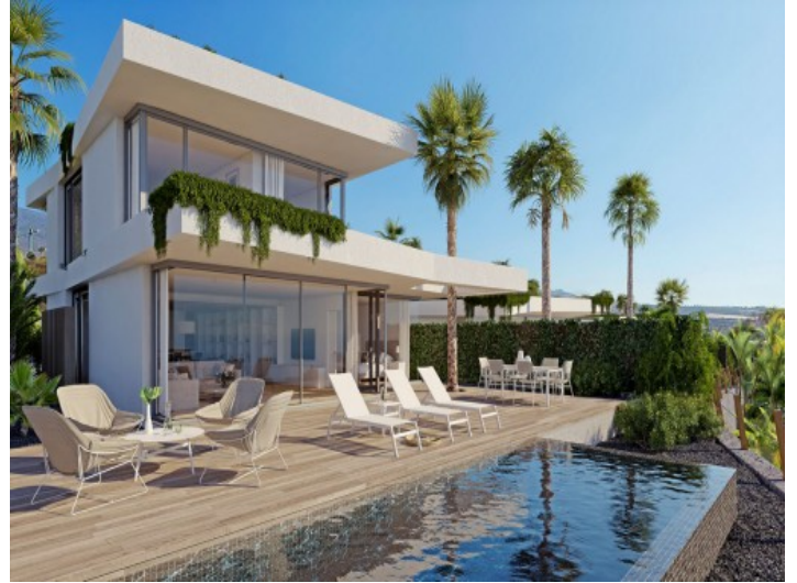
Inviting pool area