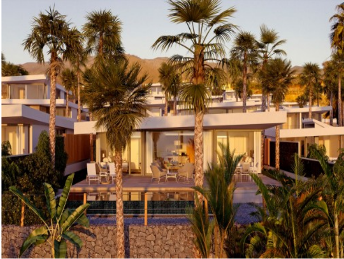
The villa by night