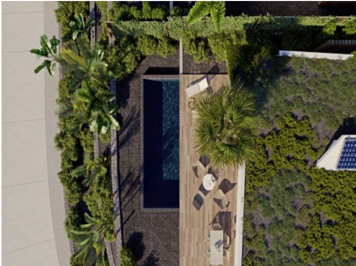
The villa from a birds-eye view