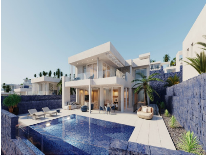
Exterior view of the villa