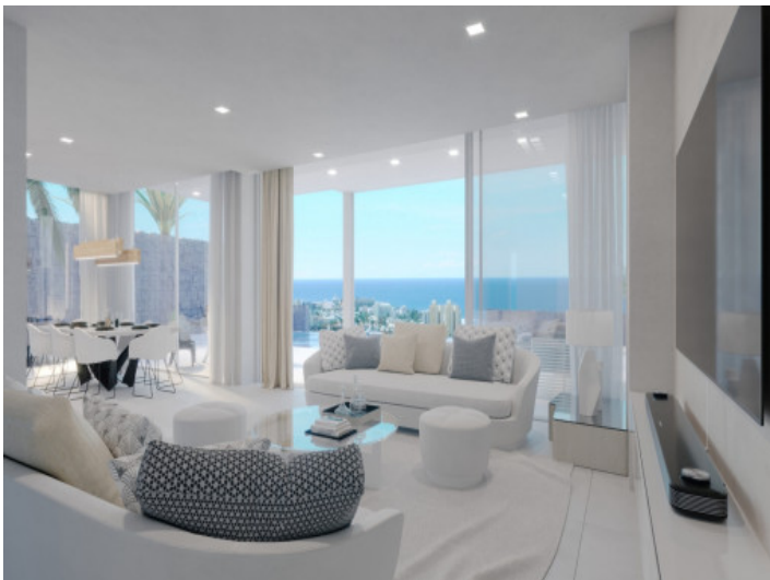
View of the living area