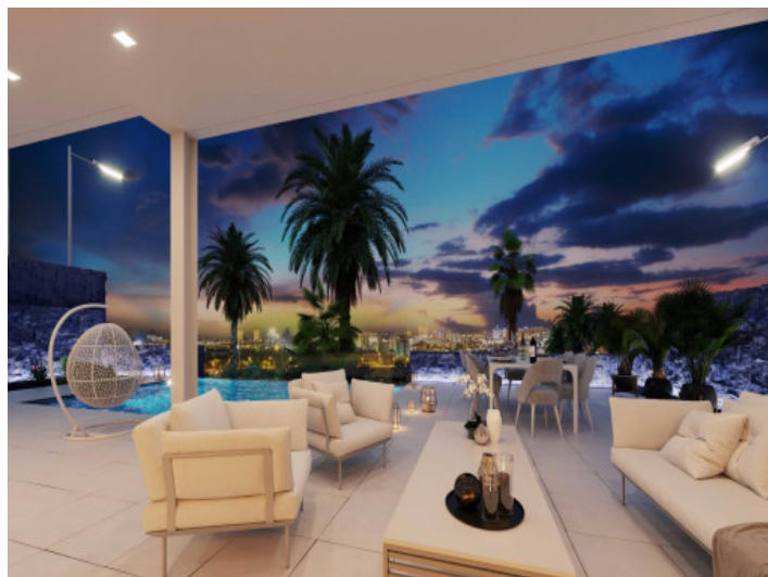
Covered terrace by the pool