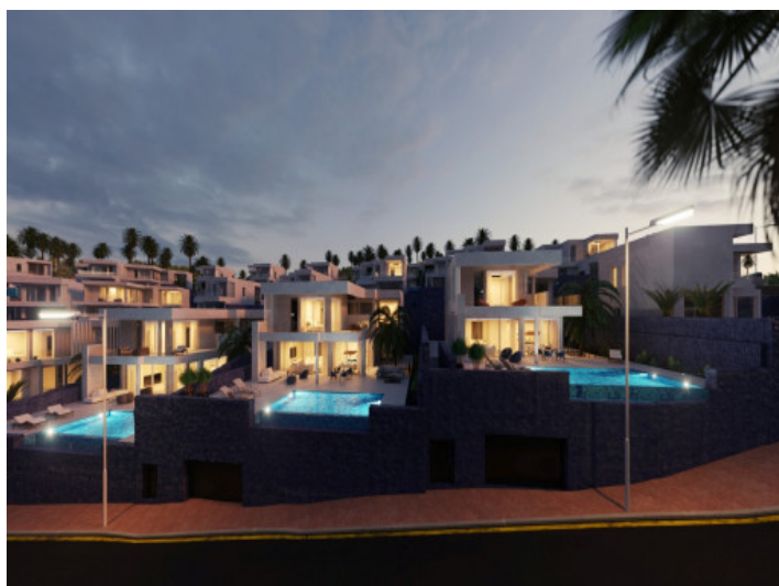
Exterior view of the villa

All information is correct to the best of our knowledge. Errors and prior sale excepted. This prospectus is purely for information purposes. Only the notarized deed of sale is legally binding.