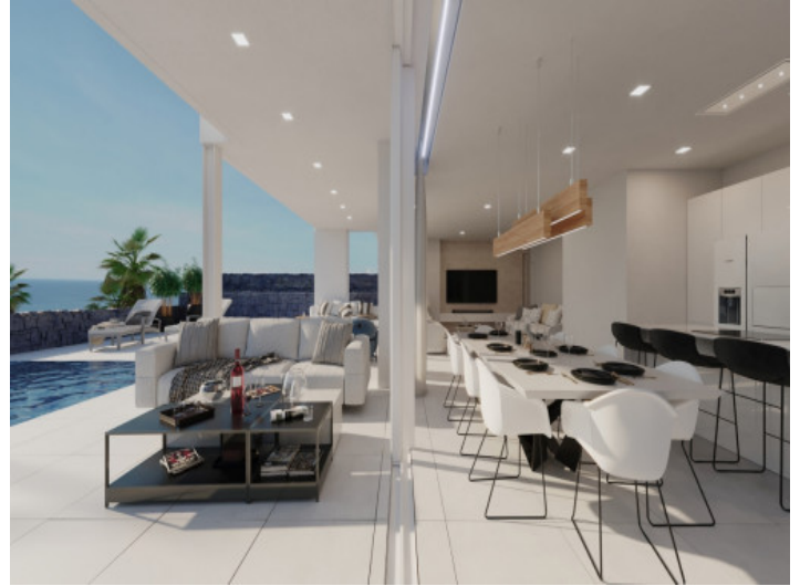
Covered terrace with dining area