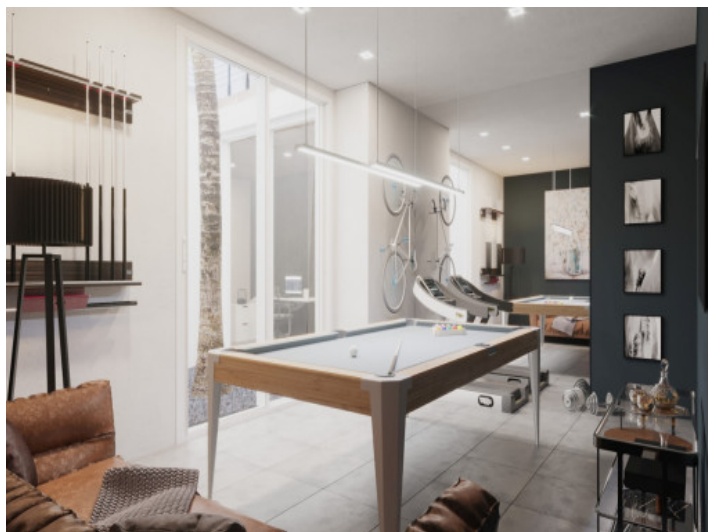
Office and hobby room