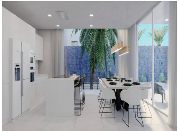
Kitchen and dining area