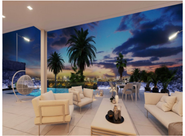
Covered terrace by the pool