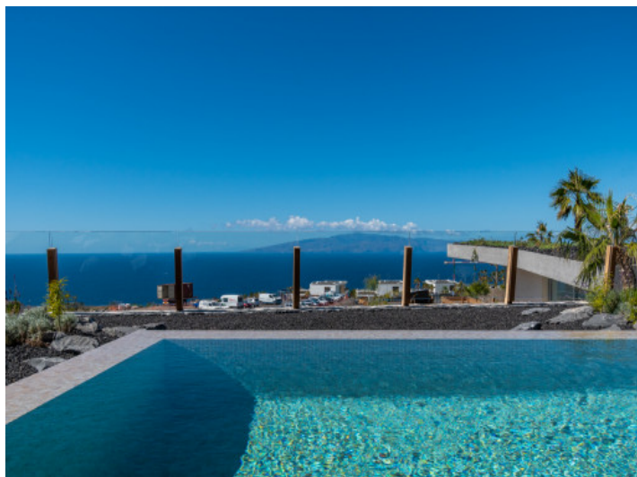
Sea view pool